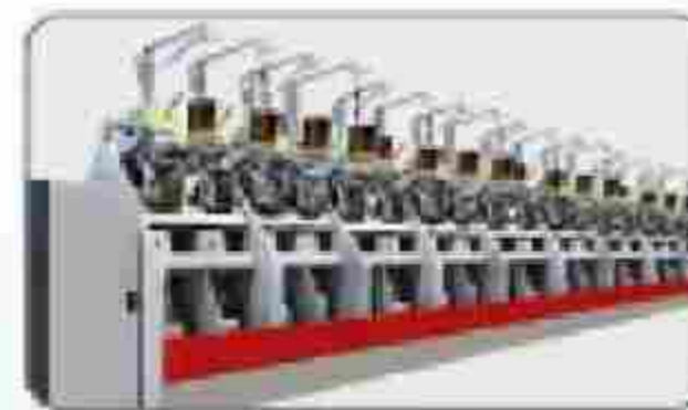
Large Package Twisters & Cablers