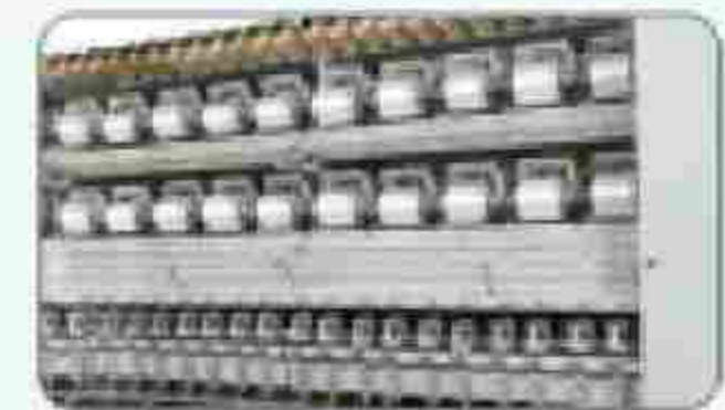
Dye Package Precision Winders